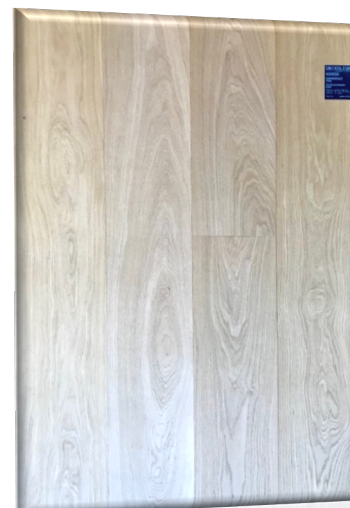
Comm. Oak EVO